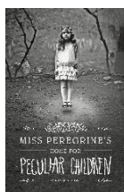
Miss Peregrine's Home for Peculiar Children Ransom Riggs

A family tragedy sets 16-year-old Jacob journeying to a remote island off the coast of Wales, where he discovers the crumbling ruins of Miss Peregrine's Home for Peculiar Children. As Jacob explores its abandoned bedrooms and hallways, it becomes clear that the children were more than just peculiar. They may have been dangerous. They may have been quarantined on a deserted island for good reason. And somehow - impossible though it seems - they may still be alive.