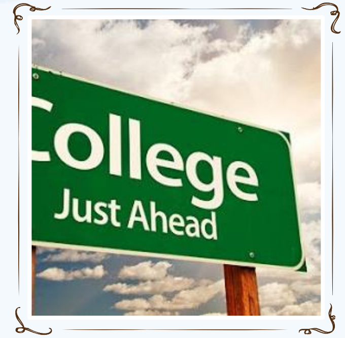
Deciding to go to college

Some changes in our lives we have NO control over, where some changes we ARE able to control, look at the images below and identify which ones we have control over. How could this change our lives?